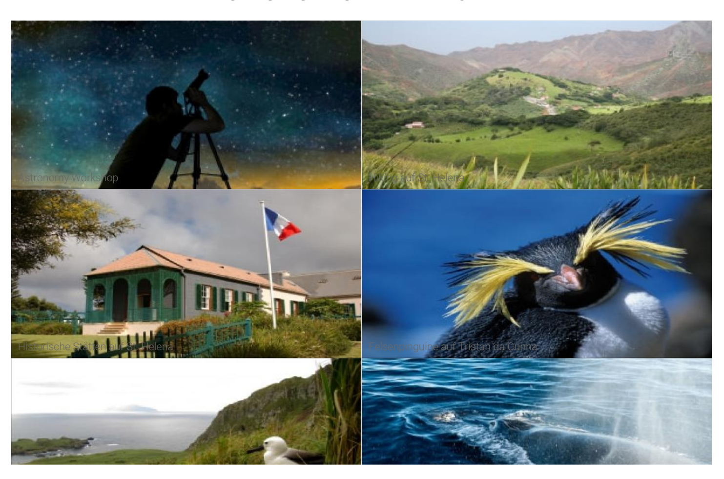
Mittwoch, 24. November 2021